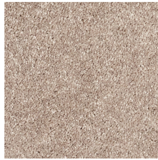
ALISA020 - Cosiness