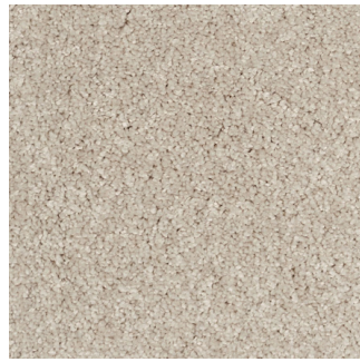
ALISA015 - Harmony