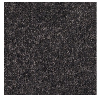
ALISA080 - Enjoyment