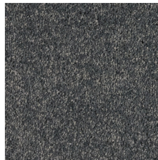
ALISA070 - Pleasant