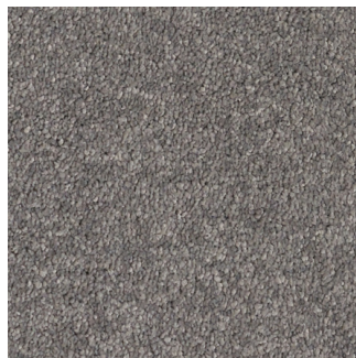
ALISA060 - Satisfaction