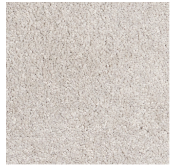
ALISA050 - Delight