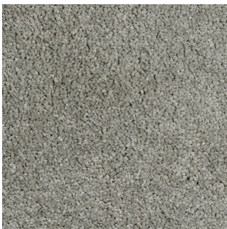
ALISA055 - Serenity